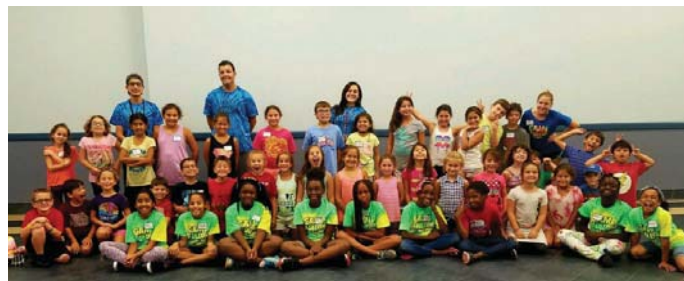
Members of the Marjorie S. Fisher and Max M. Fisher Clubs join Camp Shalom campers and learn about tolerance.