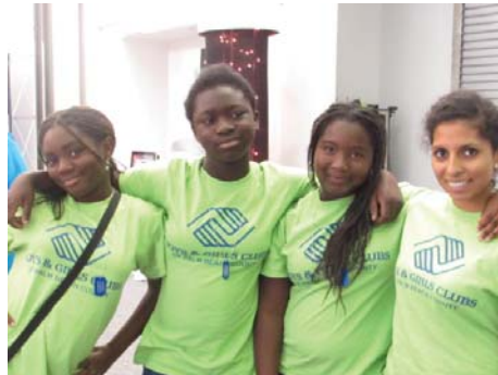
Members of the Delray Beach Advisory Team