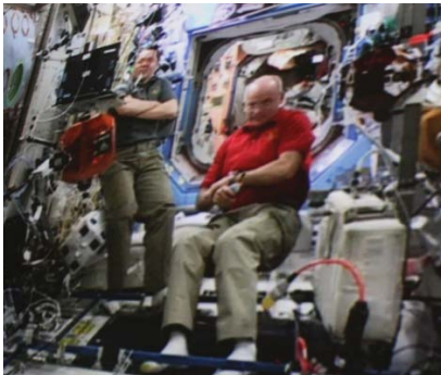
Astronauts Jeffrey Williams and Oleg Skripochka