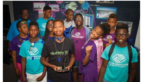
State and National Champions

Like Us on Facebook: Boys & Girls Clubs of Palm Beach County